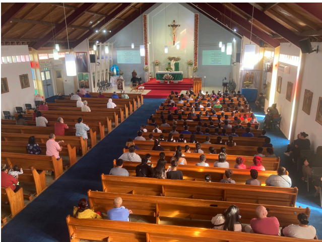
At Ash Wednesday Mass

Attending Mass for the start of the year.